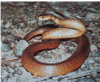
Eastern Brown snake

Words fail me, one of the biggest nonsenses in their fantasyland.