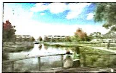
An artist's view of the plans

Property fund giant ISPT bought the 53.4ha site in 2014 for $12.5 million and since then there has been vociferous opposition to the